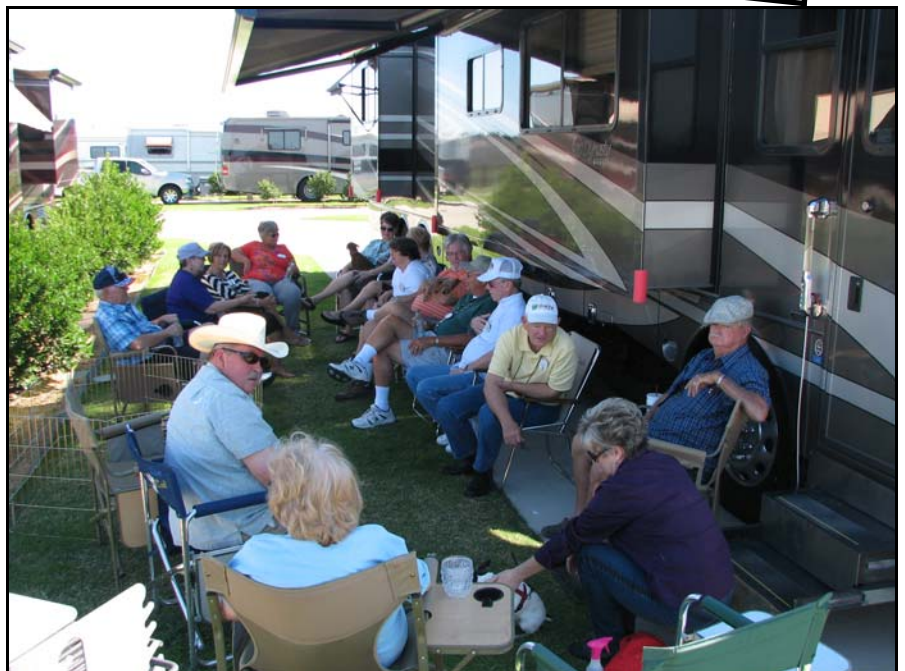
Members gather for an afternoon social before the evening gathering and dinner.