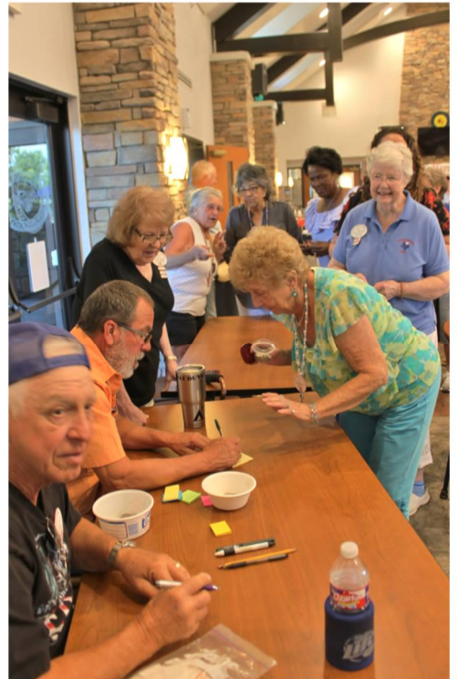
Horseracing, RRR Style