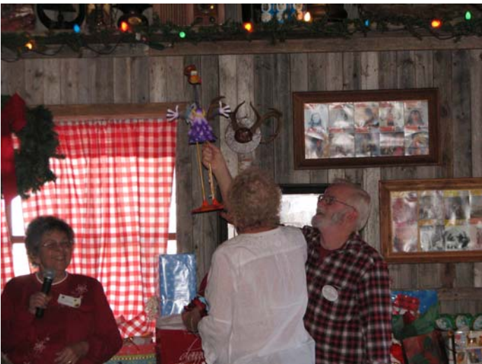
Quote of the Day: "Somebody finally gave Hazel the bird".