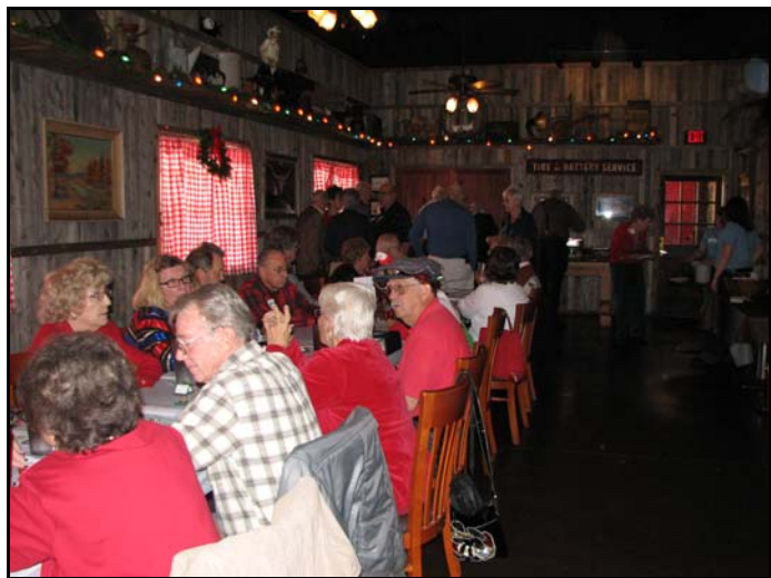
Members enjoy a great lunch.